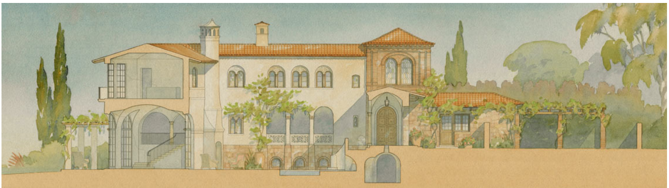
Watercolor building section showing site context (Drawing by Michael G. Imber Architects)